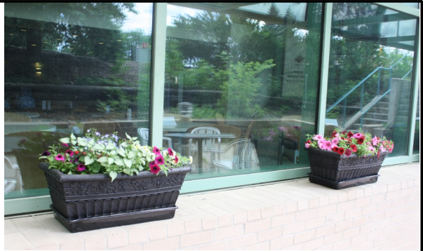
SPH Cafeteria Patio