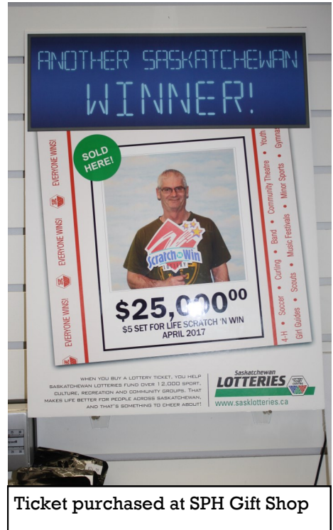
Ticket purchased at SPH Gift Shop

An appreciation “bouquet” to the group of spiritual care volunteers who create and deliver flower arrangements about the hospital on a weekly basis. They are taking a summer break, but will be back in September. The flowers are donated from Grower Direct (8th St.) and Sobey's (College Park Mall). This is a wonderful way to brighten a patient's day, especially when it's a surprise.